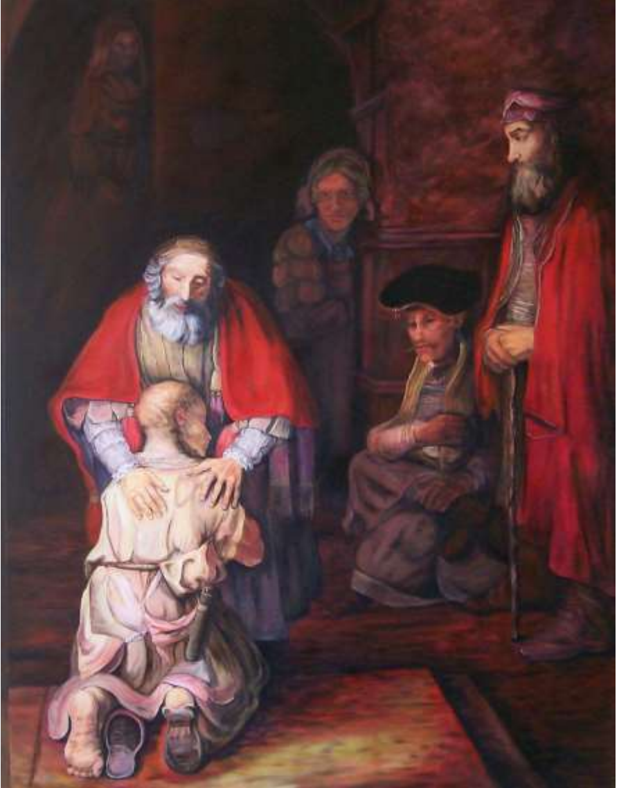
Rembrandt van Rijn, The Return of the Prodigal Son , c. 1661–1669